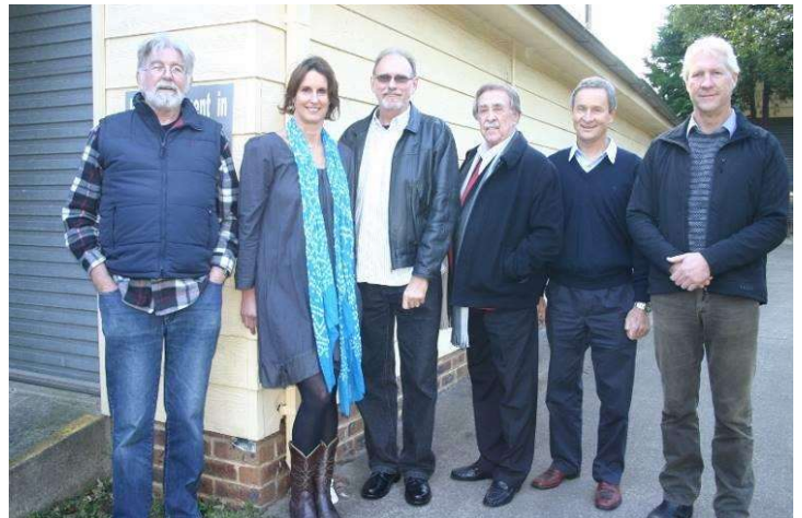
Original Formation Committee