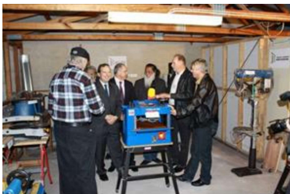
Dignitaries inspecting the Shed