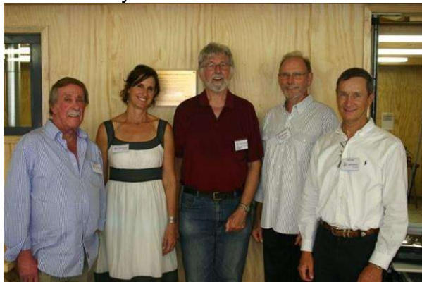
Part of our Formation Committee