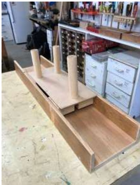
Waverley Community Men's Shed

Showing the versatility of our technical team, they were able to provide an arm exercise trolley for St Vincent's Hospital Physiotherapy: