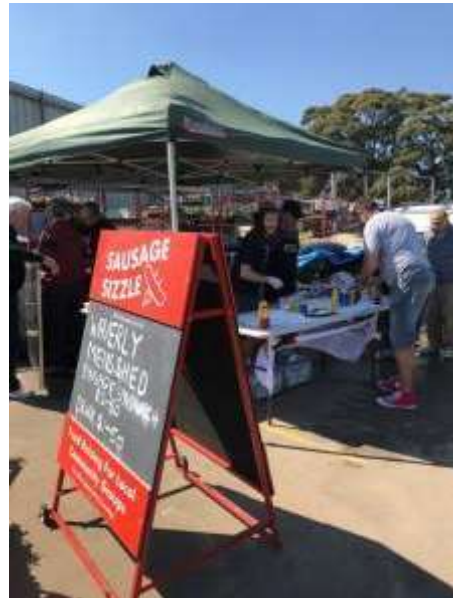
Bunnings Randwick sausage sizzle

Once again in September, to mark Father's Day, Bunnings Randwick generously provided their premises to hold a fundraising sausage sizzle. And once again many of our members gave up their time to help out. We are extremely thankful to Bunnings Randwick for enabling us to raise funds while at the same time to promote the Waverley Men's Shed. Bunnings have also been generous with gift vouchers and product donations to the Shed.