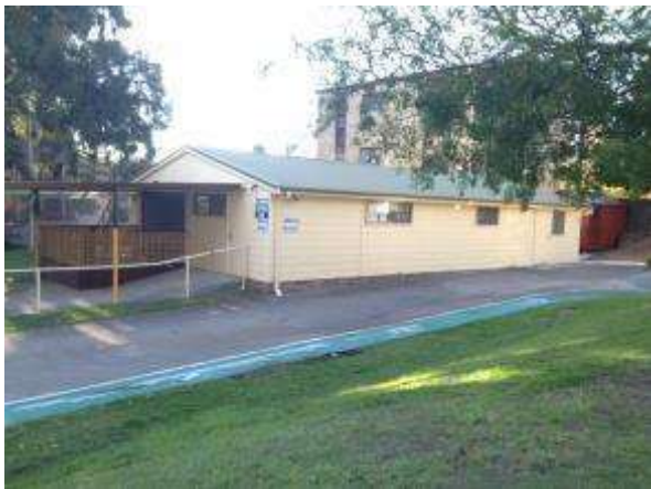
The Waverley Shed