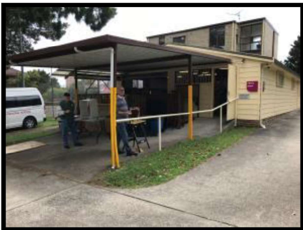
The Waverley Men's Shed