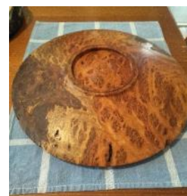
The winning entry, front and back