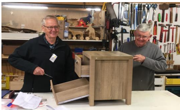
Building chests of drawers and highboys for the War Memorial Hospital .