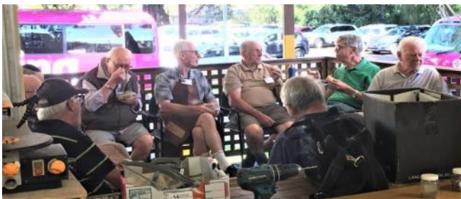
'No Work' lunch break

The 'no work' lunch break, is strictly observed and all daily participants in the Shed get a chance to talk together and solve the world's problems.