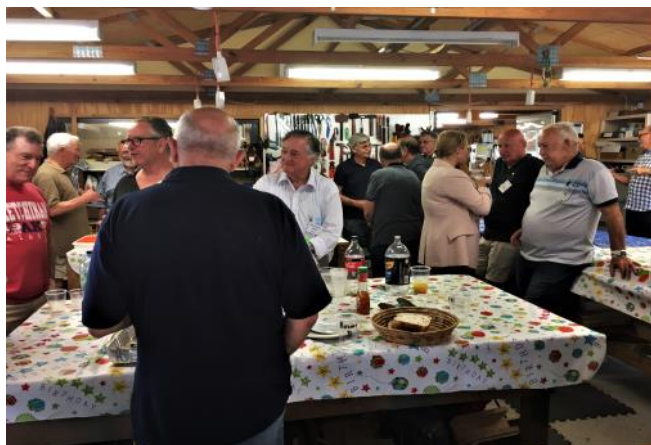
After most of the limitations and gatherings were lifted, the members enjoyed their end of year party

Since the last AGM we had a very successful end of year party limited catering considerations due to the pandemic, so the members couldn't bring their favourite foods.