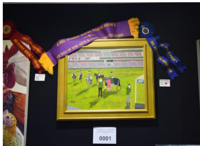
"The Long Day" with the winning ribbons