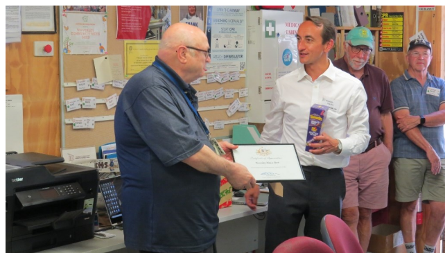
Certificate of Volunteer Grant is presented by Dave Sharma MP (the then Member for Wentworth)