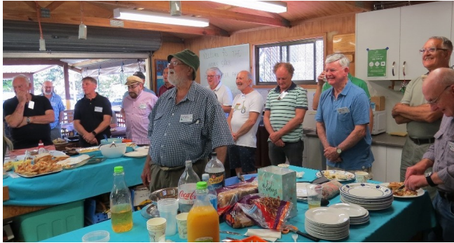
After most of the limitations and gatherings were lifted, the members enjoyed their end of year party

Since the last AGM we had a very successful end of year party limited catering considerations due to the pandemic, so the members couldn't bring their favourite foods.